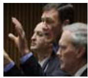
Houston panel rolled the pens on boats - is a caption

It came as no surprise that the failure of the government to ban this trade has been an ongoing a source of disbelief for caring Australians and, for many, despair.