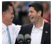
esson in crazy ive politics from ek old Mitt - this caption

A essor n razy rave olitic rom neek old Mitt