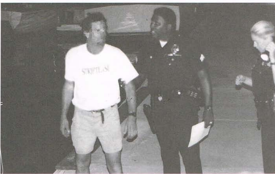
Restrained by police, the suspected pet thief glares at a LCA investigator and shouts obscenities