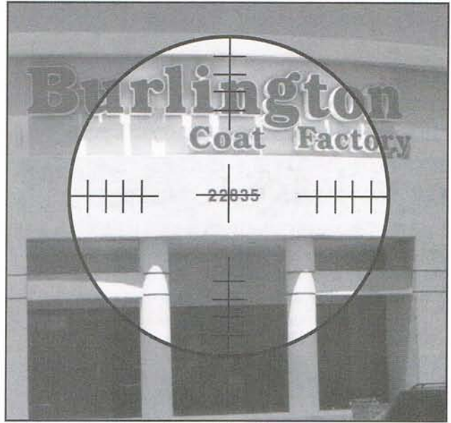
Burlington Coat Factory is one of the primary contributors to fur animal suffering with its 250 high-volume stores around the U.S.