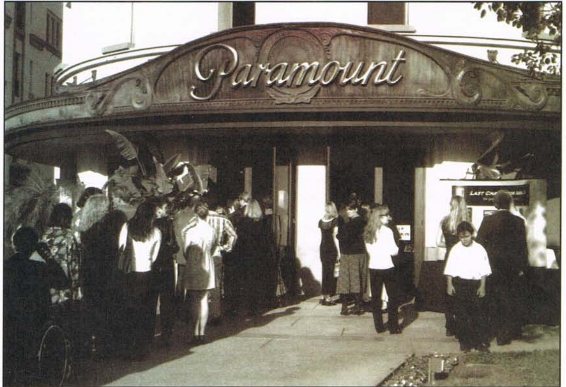
The beautiful entrance of Paramount Studio's main theater greeted 600 friends and supporters of LCA.