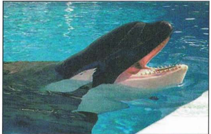
Tillikum once swam in the North Atlantic ocean, now enslaved to breed for Sea World's profit.

Wild orca swim up to 100 miles daily. Sea World's largest holding pen takes an orca less than ten seconds to cross.