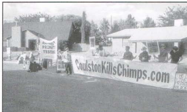
Animal activists and Alamogordo, NM residents gather at various locations to spread the truth. Some protestors stood less than 100 feet away from the chimps suffering at the hands of the Coulston Foundation.

Chris noted the commitment of the activists who have dedicated three months to ride on a crowded bus and protest animal abuse day after day in the name of compassion. He comments, "These people, mostly youth, are taking the first tour of its kind for animals, stopping at primate labs around the country to educate millions of people. They're to be commended."